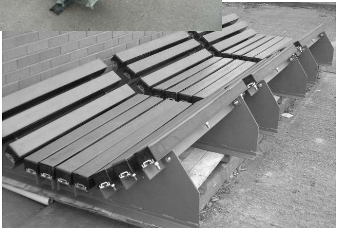
Heavy Duty Impact Beds & Impact Idler Set Designed & Manufactured In-house

Note: Should you require any further technical advice with regards to drawings, fitting and maintenance please contact us